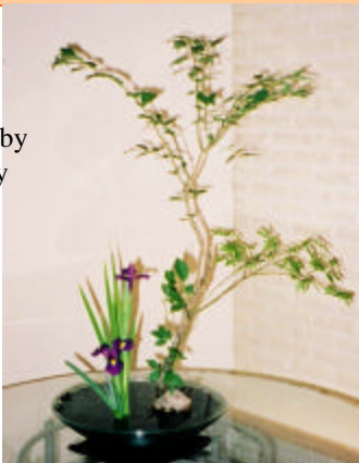
Futakabuike