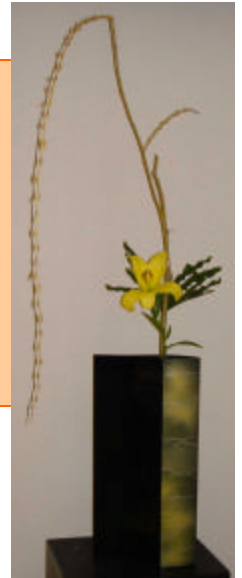
Shoka Shimputai by Kimiko Gunji