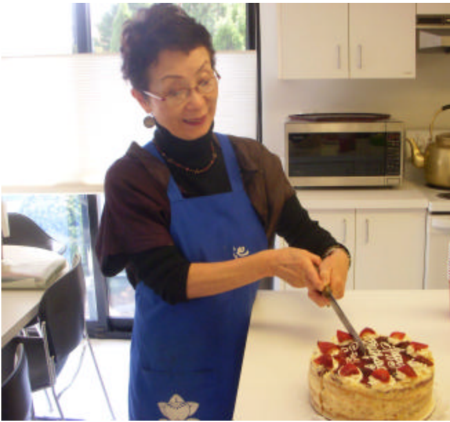
“Happy Birthday Sensei” cake

To the members of the Prairie Ikenobo Ikebana: